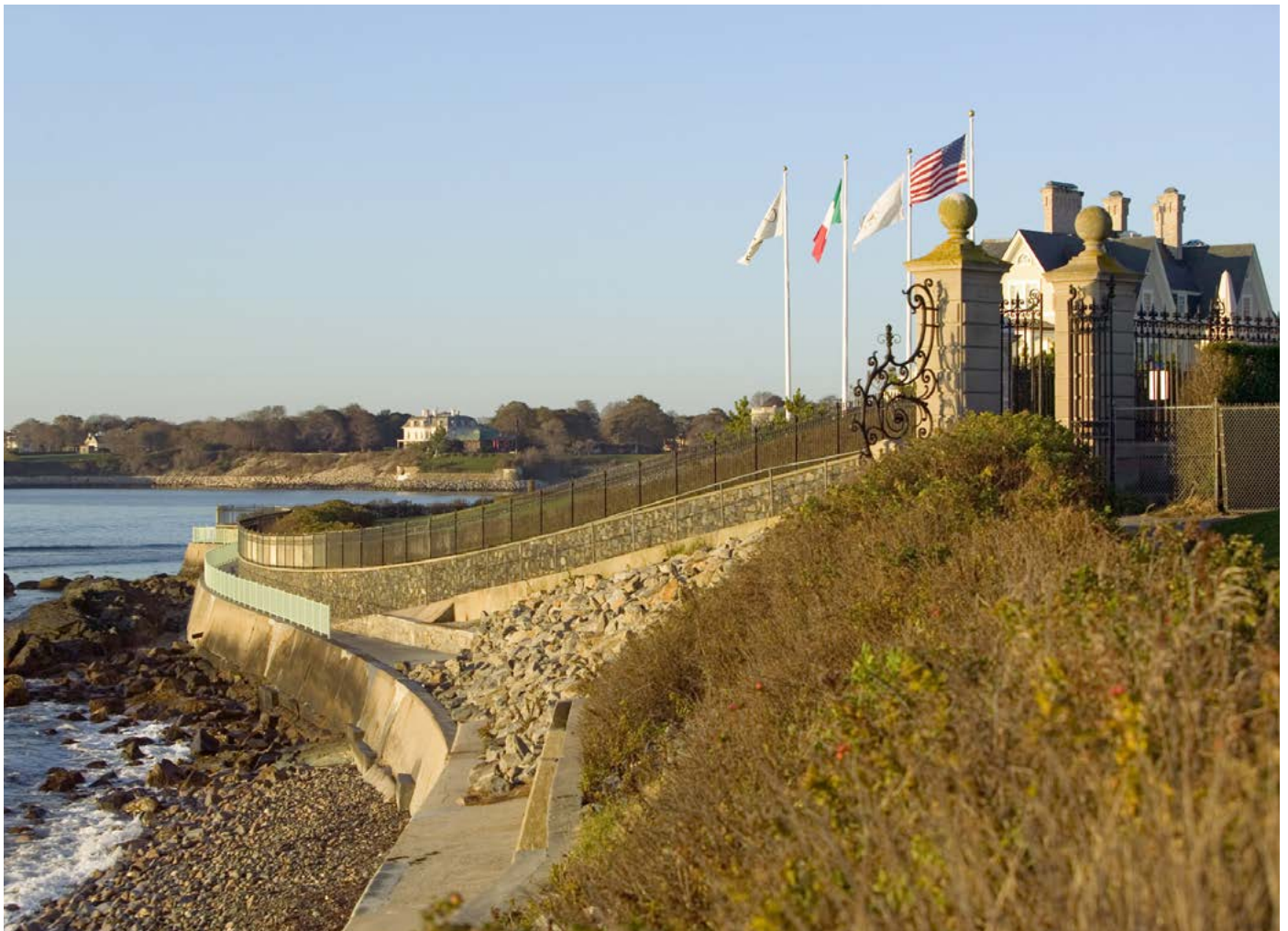
The Cliff Walk, Cliffside Mansions of Newport Rhode Island

Memorial Blvd. & Eustis Ave. cliffwalk.com