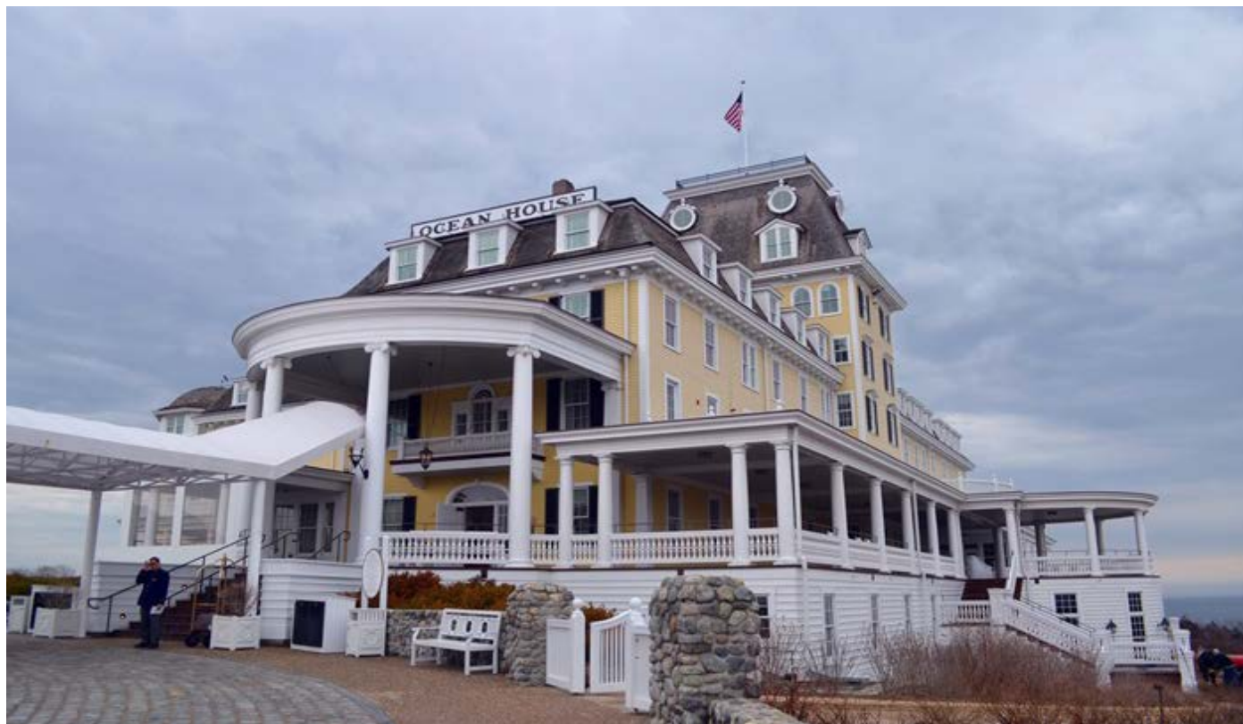
Best Luxury Escape | Ocean House, Watch Hill

62 Dodge St. 401-466-2722; dariusblockisland.com