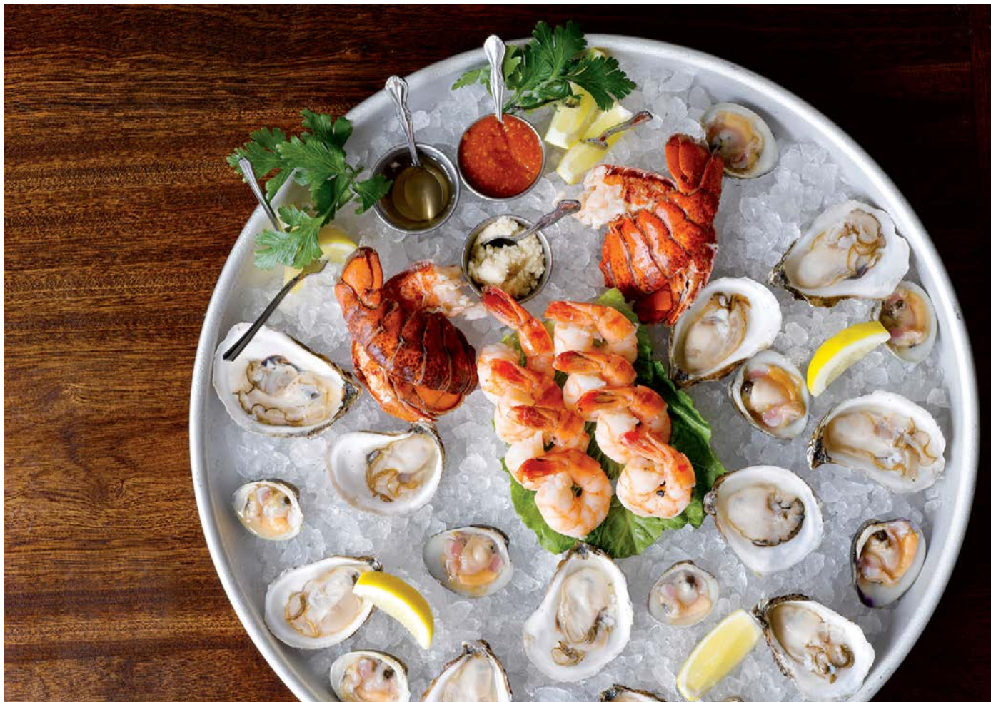
Best Raw Bar | Midtown Oyster Bar, Newport