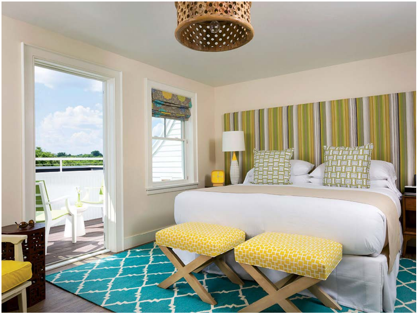
Best Coastal Chic | The Break, Narragansett