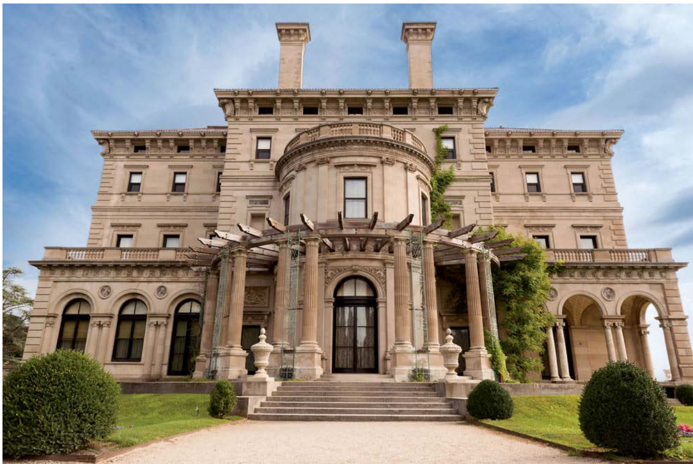
Best Mansion for Kids | The Breakers, Newport