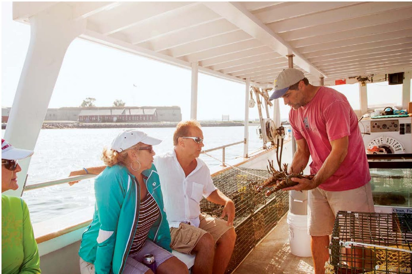
Best All-Ages Boat Trip | Fish'n Tales Adventures Lobster Tours