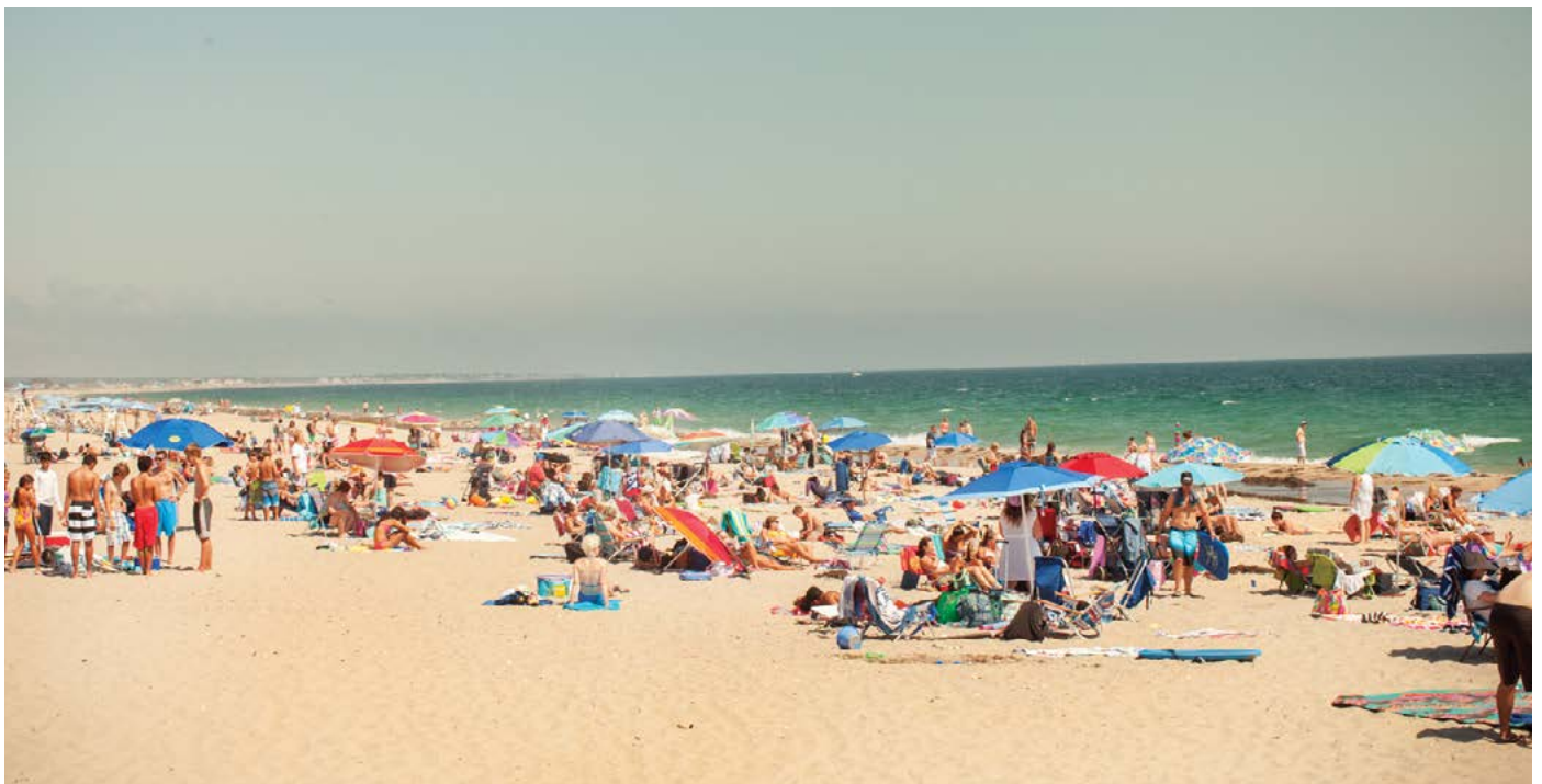
Best Beach | Narragansett Town Beach

39 Boston Neck Road. 401-783-6430; narragansetttri.gov/323/Narragansett-Town-Beach