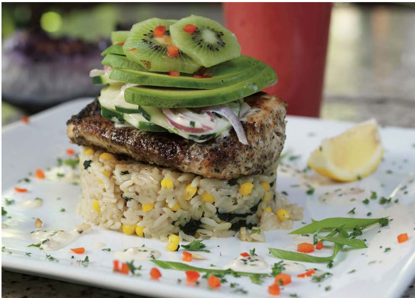
Best Lunch | Crazy Burger, Narragansett