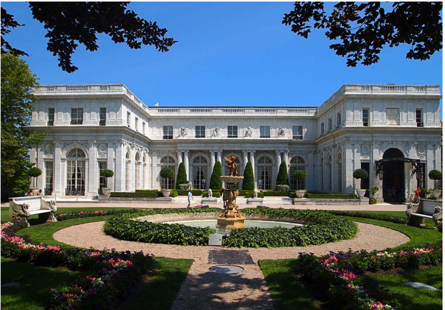
Front facade of Rosecliff mansion

I first toured The Elms, which still captures the elegance it was renowned for, with its intricate ceiling and wall detailing and vast collection of cultural art.