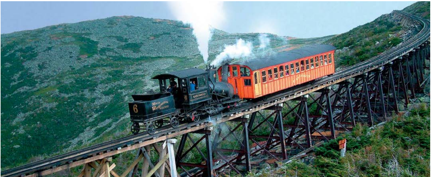
Cog Railroad steam locomotive on Jacob's Ladder

I've just arrived at the base of the Mount Washington Cog Railway — one of New England's most historic and scenic mountain experiences. As the world's first mountain-climbing cog railway, "the Cog" has been carrying passengers to the 6,288-foot summit of Mount Washington (the Northeast's highest peak) since 1869, and shows no signs of slowing down.