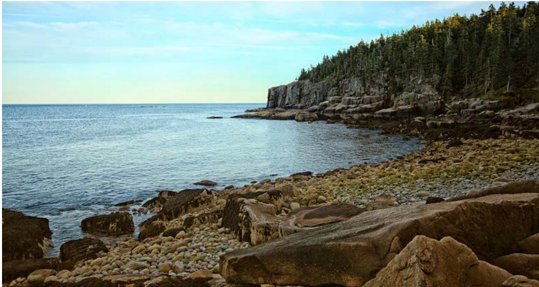
Rocky Coastline Acadia National Park

Maine's Acadia National Park is a favorite of photographers for its combination of accessible mountain views and quintessential coastal scenery. For Jerry Monkman, author of The Photographer's Guide to Acadia National Park (Countryman Press, 2010), the park has been a go-to location for photography and family vacations for more than 20 years. Here's his list of the 5 best photo ops in Acadia National Park. Maps and info about the park are available at nps.gov/acad/index.htm or by calling 207-288-3338.