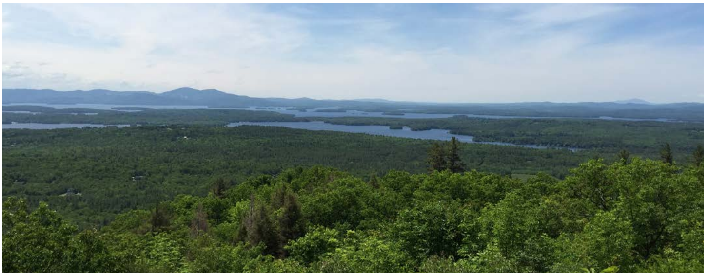
View of Lake Winnepesaukee from Castle in the Clouds

455 Old Mountain Road. 603-476-5900; castleinthecLOUDS.org