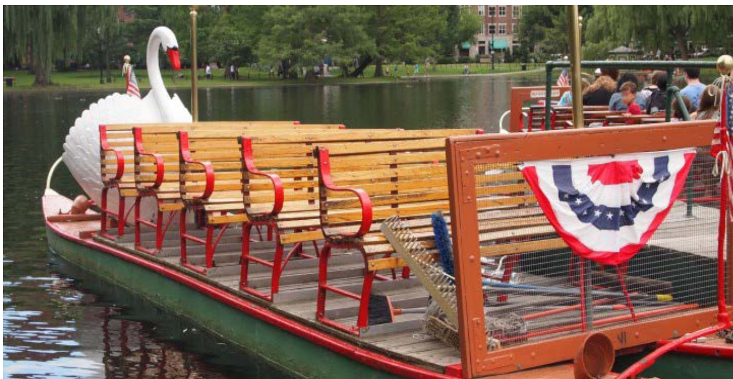
Swan Boats