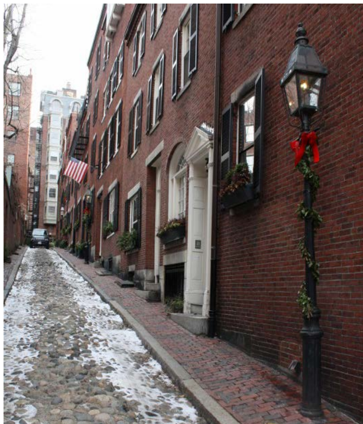
Acorn Street on Beacon Hill