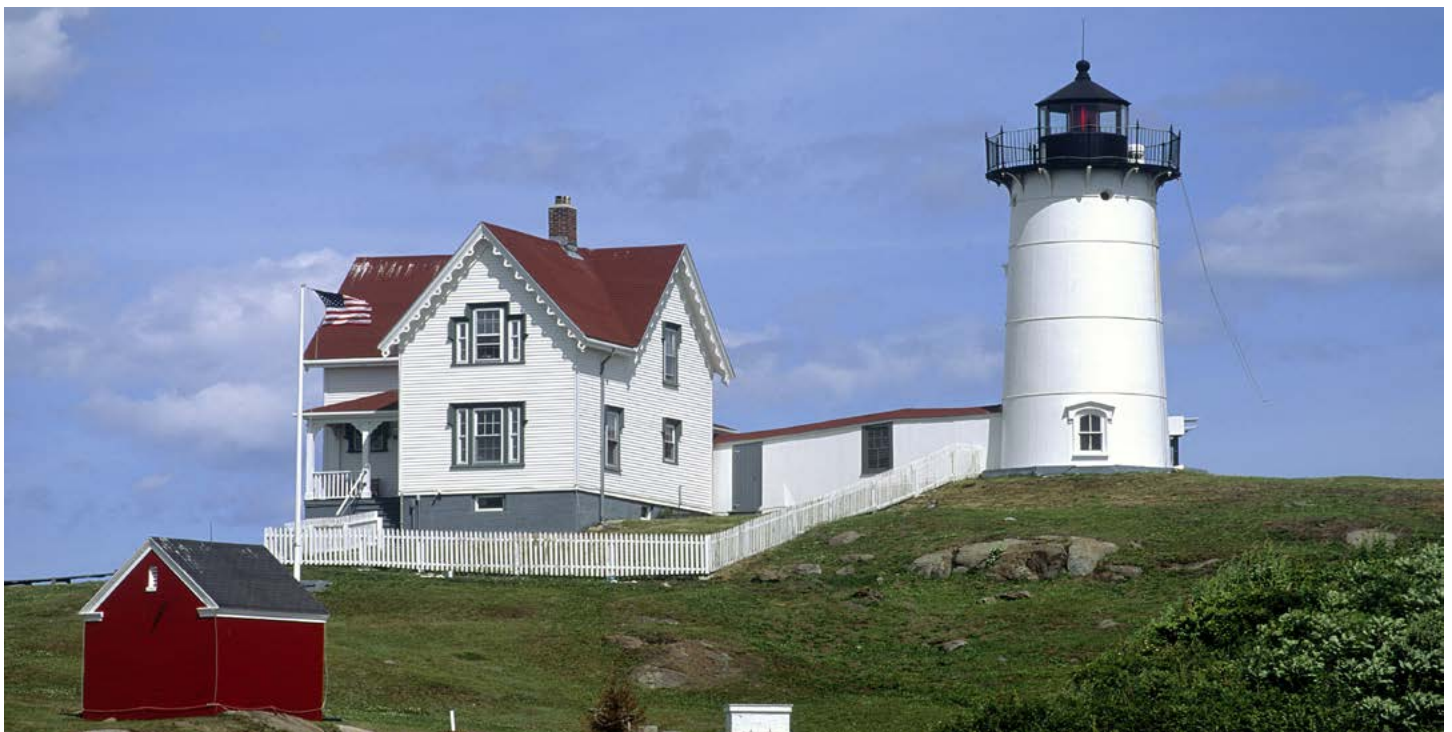
The Nubble Light

The romantic allure of Nubble Light is two-fold. Not only is the structure and setting almost painfully idyllic (the rocky coast, sturdy light, and button-cute adjoining keeper's house -- which, for the record, is unoccupied and has been since 1987), but the island setting just a hundred yards across the water from Sohier Park on the main-