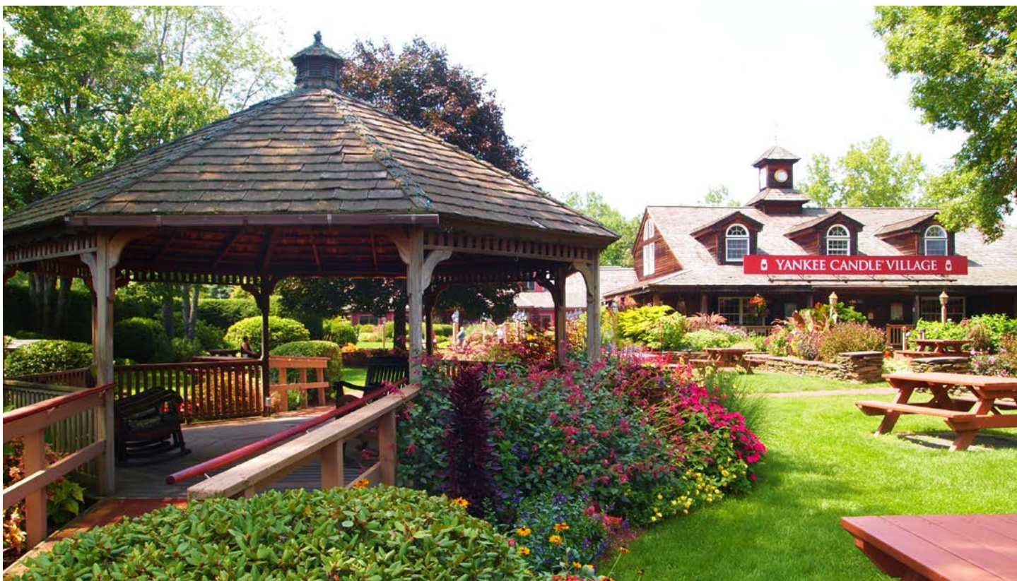
Yankee Candle Village

Making Museum and learn how these famous candles were made in the past and today.