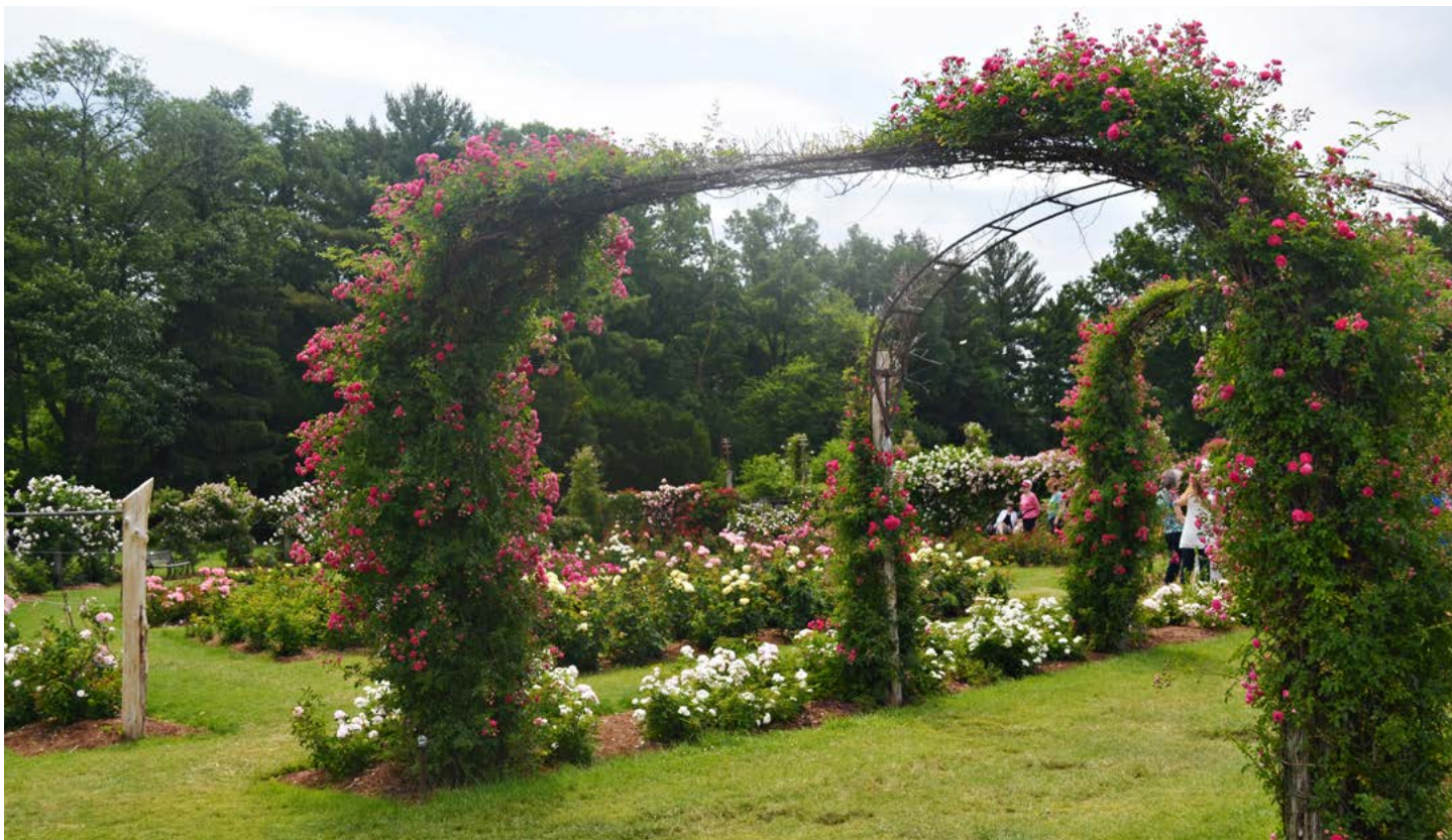
The famous rose garden at Elizabeth Park.

Leaving the natural beauty of Elizabeth Park behind, I headed downtown (just a 10 minute drive) in search of something to eat and some history. Since it was lunchtime on a weekday, downtown Hartford was bustling with office workers enjoying the sunshine and growing number of food trucks.