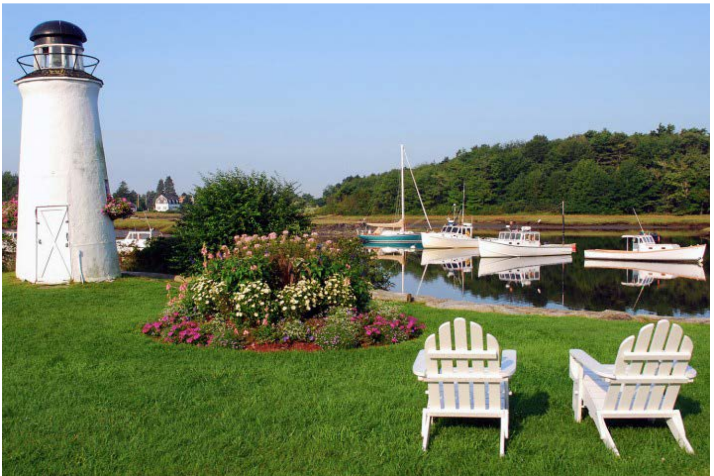
Kennebunkport, Maine

Leave Route 1’s hurly-burly behind to discover this historic little town at the mouth of the Penobscot River estuary. No wonder Castine has been drawing artists for 150 years—there’s even a 3-day plein air art festival in July.