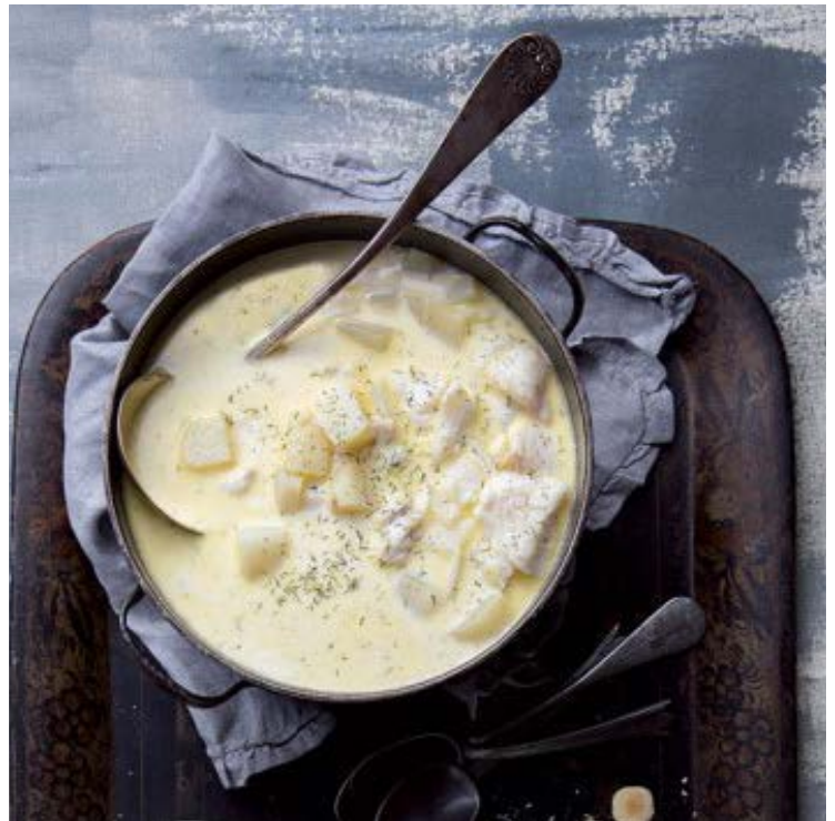
Haddock Fish Chowder

Combine stock, onion, carrots, potatoes, parsley, and basil in soup kettle. Bring to a boil, reduce heat, and simmer, partially covered, 10 minutes. Add tomato or V-8 juice. Bring mixture to a boil again, add haddock, reduce heat, and simmer, partially covered, 10 minutes, or until fish is tender. Season with salt and pepper.