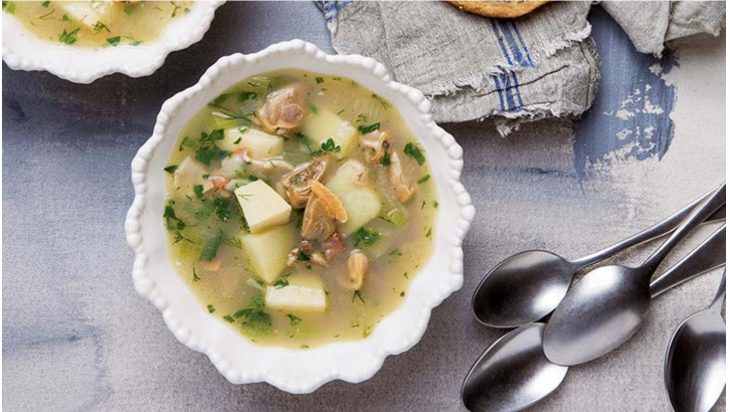
Fish Stew from Helen's Restaurant.