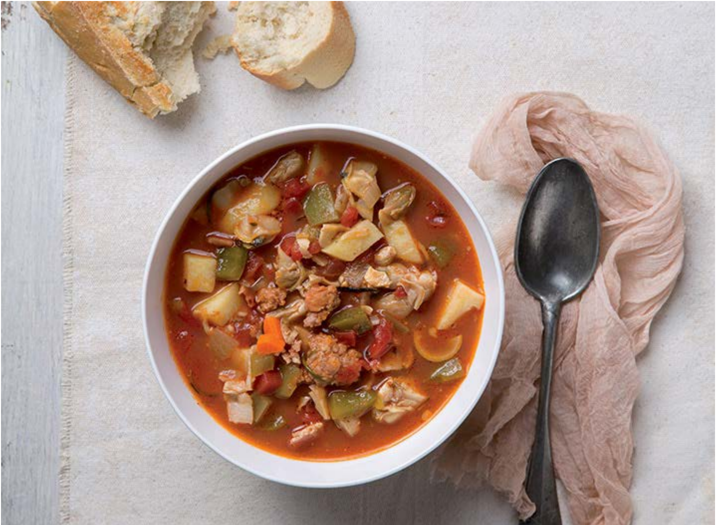
Manhattan Clam Chowder with Spicy Sausage from The Reservoir Restaurant & Tap Room.

In a 5- to 7-quart pot over medium heat, cook the bacon, sausages, and ½ cup of the potatoes until the sausages and bacon are browned. (Use a spoon to break up the sausages as you go.) Add the garlic, onion, celery, carrots, bell pepper, and herbs. Cook, stirring, until the vegetables are tender and the onions translucent, about 10 minutes. Increase the heat to medium-high and add the bottled clam juice, stirring to scrape any browned bits off the bottom of the pot. Add the tomatoes in their liquid and the remaining ½ cup of the potatoes. Bring the chowder to a simmer. Add Old Bay and season with salt and pepper. Simmer (don't boil) until the potatoes are tender, 15 to 20 minutes. Add the clam meat with its juices to the chowder just before serving. Serve hot.