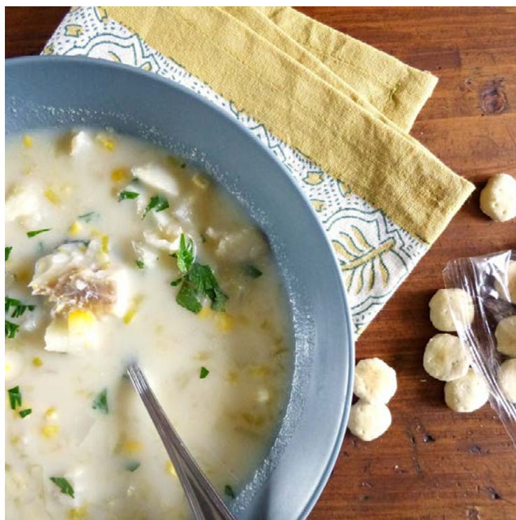
Corn and Cod Chowder

9 slices bacon, roughly chopped 3 medium leeks, washed and sliced thin, tough outer and top dark leaves discarded 4 cups low-salt chicken broth 1 bay leaf 3 medium russet potatoes, peeled and cut into 1/4-inch cubes 2 cups fresh or thawed frozen sweet corn (about 3 ears) 1 pound fresh skinless, boneless cod fillets (try the thicker loins) 2 cups whole milk 1 teaspoon salt 1 teaspoon ground black pepper, or to taste 3 tablespoons chopped fresh parsley