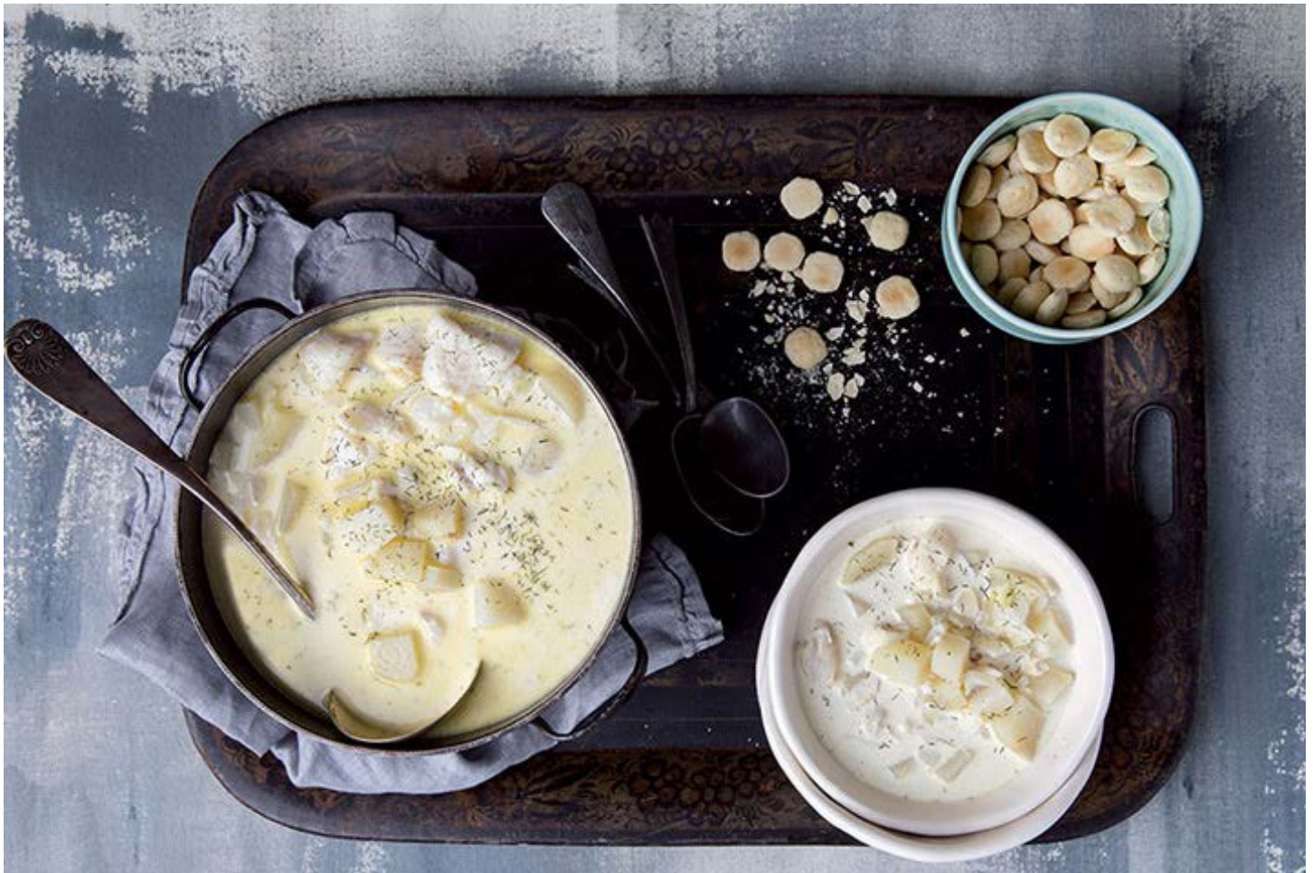
Fish Stew from Helen's Restaurant.