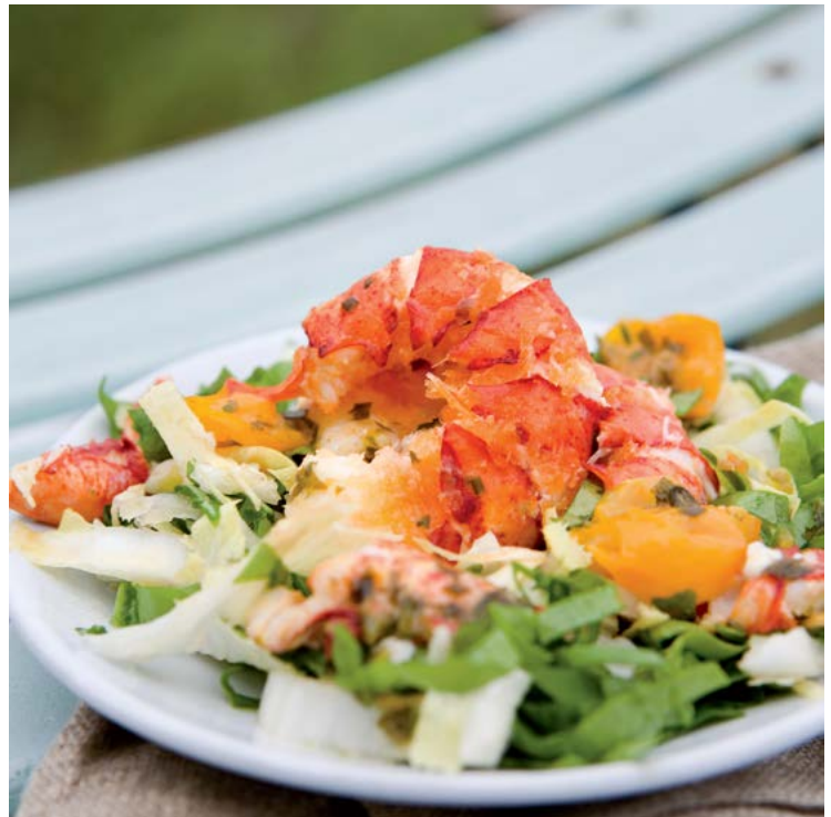
Crispy Lobster-Tail and Pea-Tendrils Salad

2 fresh basil leaves, chopped fine 1 shallot, finely diced 4 tablespoons unsalted butter, melted Sea salt and freshly ground black pepper, to taste 3 boiled or steamed lobsters, tails separated, left in shell and cut in half, claw and knuckle meat removed 1/2 cup toasted panko crumbs 2 tablespoons unsalted butter 2-1/2 tablespoons olive oil, divided, plus extra for garnish 1/4 cup cherry tomatoes, halved 1 tablespoon chives, chopped fine 1 tablespoon parsley, chopped fine Juice of 1/2 lemon 1 tablespoon white wine vinegar, divided 1/4 pound pea shoots or tendrils (or use mixed spinach leaves and endive)