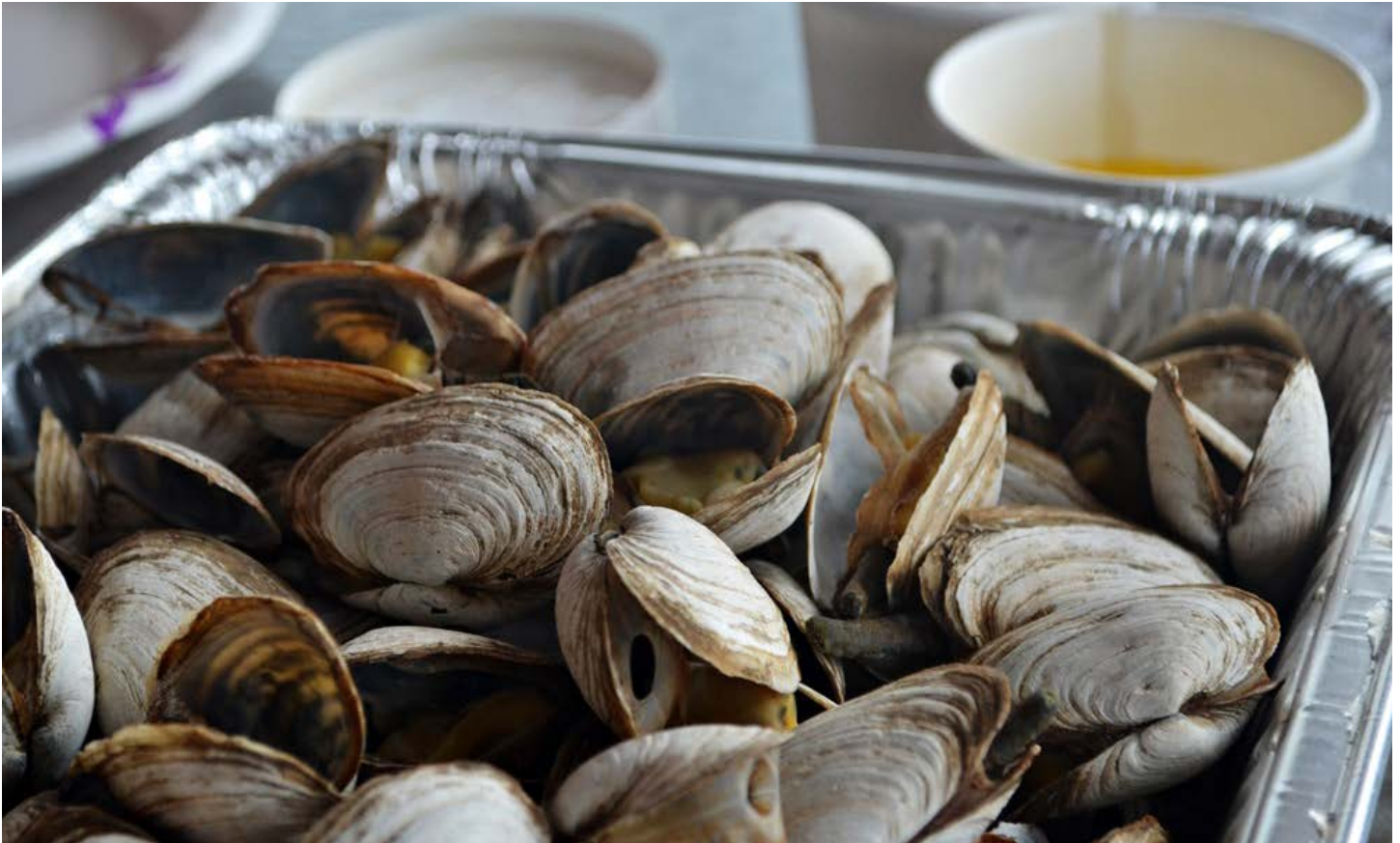
Steamers with broth and hot butter.

don't worry, you're not alone. Let's see if we can break it down, shall we?