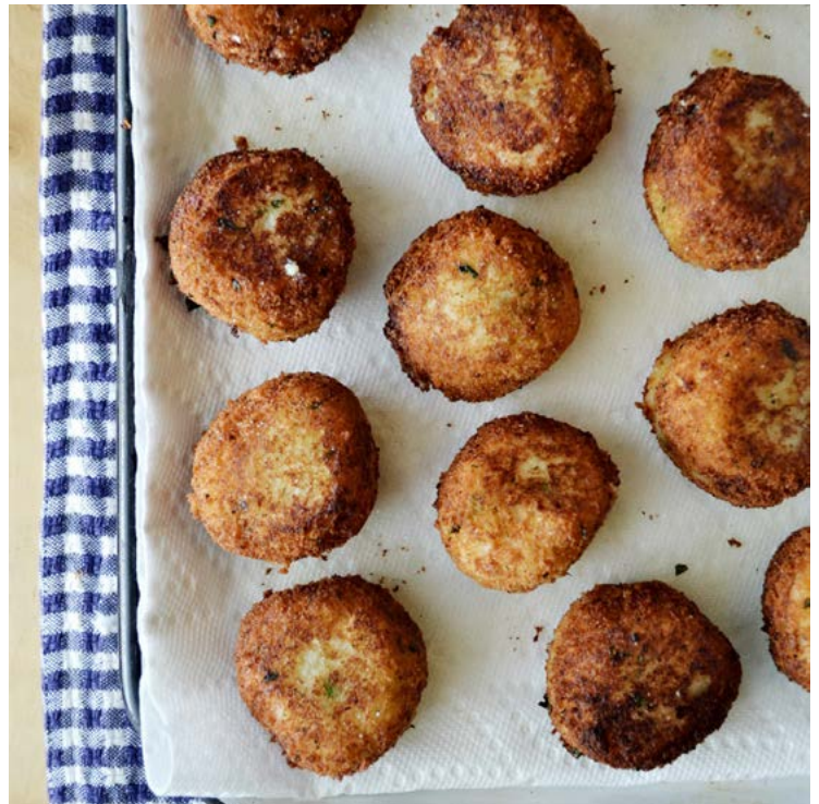
Codfish Balls

Rinse the fish in cold water, then transfer to a shallow casserole dish and cover with cold water. Allow the fish to soak up the water, changing the water a few times as needed, until thoroughly re-hydrated, up to 24 hours. Drain and flake the fish. Boil it with the peeled and cubed potatoes until the potatoes are tender. Drain. Put back on the fire momentarily to dry completely. Mash the mixture, add butter and pepper and beat until fluffy. Add the eggs and continue beating. Shape into 2-inch balls and drop into deep hot fat (375 degrees F) and fry until golden brown. Codfish cakes may be made instead by dropping the mixture onto a hot, lightly greased griddle and browning on both sides. They are good served with fried tomatoes or tartar sauce.