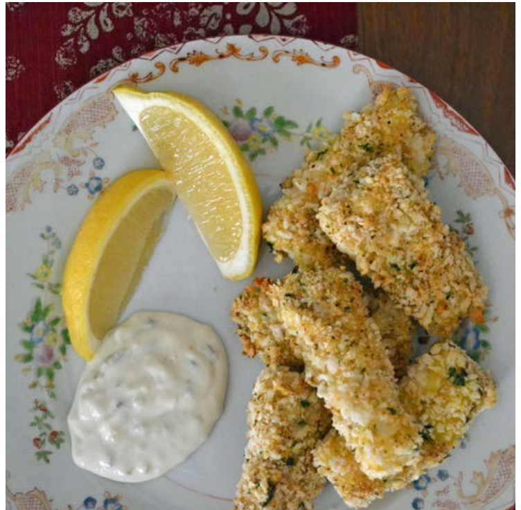
Homemade Fish Sticks

Preheat oven to 450 degrees. Place flour in one bowl, beaten eggs in a second bowl, and in a large shallow dish, combine the panko and spices. Once combined, toss the crumbs with the olive oil. Cut the fish fillet(s) into equal-sized strips (about 4 inches long). One by one, dredge the strips in the flour, tapping to remove any excess, then arrange on a cutting board. Once all of the strips have been floured, dip them into the beaten eggs, then the seasoned crumbs, making sure to press firmly so the crumbs stick. Arrange the finished fish sticks on a baking sheet lined with foil that has been lightly greased with cooking spray. Give the fish sticks a few spritzes of olive oil or cooking spray, then bake the fish sticks for 10-18 minutes, depending on thickness. Flip the sticks at about 7 minutes so they cook evenly. Alternately, you can add a few inches of oil to a heavy skillet and fry the fish sticks until golden brown, about 3-4 minutes per side. Transfer to a plate lined with paper towels to drain before serving. Serve homemade fish sticks with lemon wedges and tartar sauce or cocktail sauce.