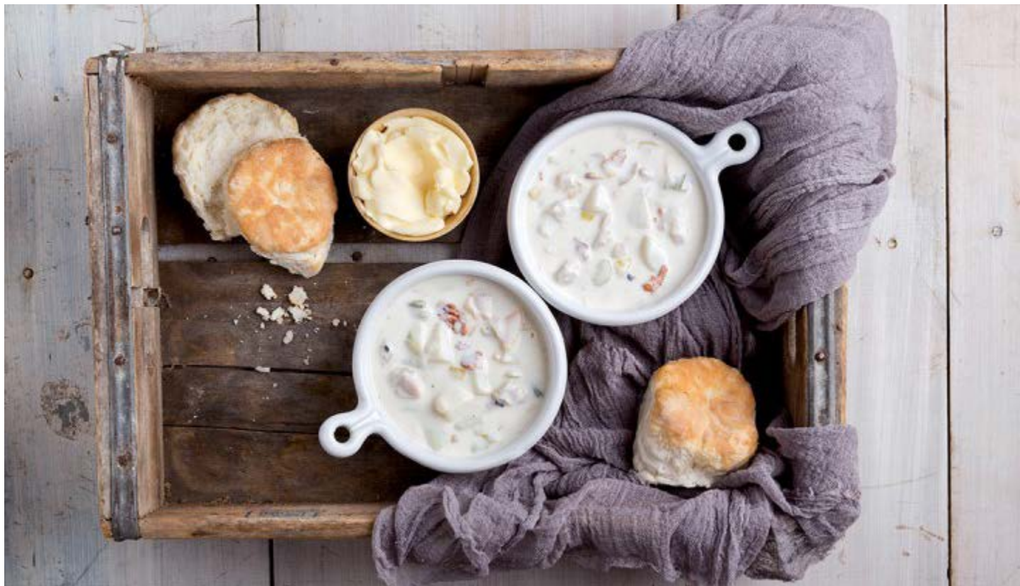
New England Clam Chowder from Chatham Pier Fish Restaurant.

Note: Many supermarkets carry frozen, chopped clam meat in 1-pound containers, which is fresher than canned and just as convenient. Simply defrost before using.