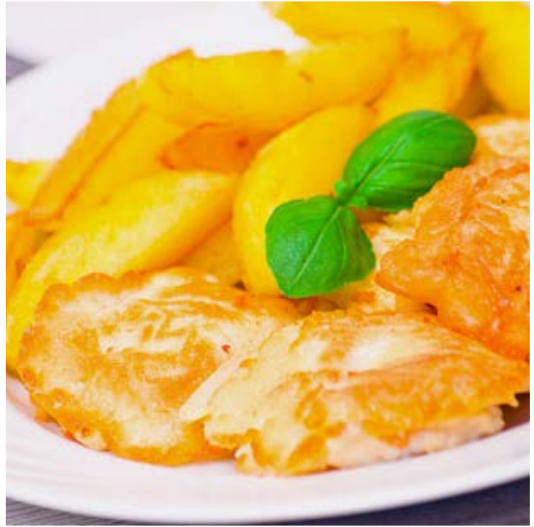
Oven Fried Fish Fillets

Cut the fillets into serving pieces. Add the salt to the milk. Dip the fillets in milk and roll in the cornflake crumbs. Place on a shallow, well-greased baking pan, skin down. Sprinkle each piece with melted butter or margarine. Bake in a 500 degree oven for 10-12 minutes, or until the fish flakes. Garnish with lemon wedges and serve with tartar sauce.