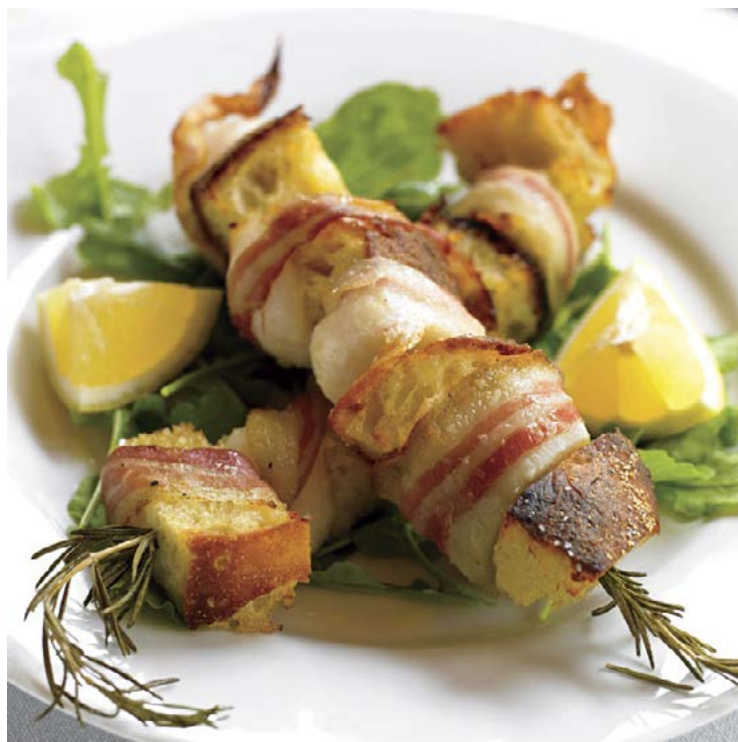
Grilled Scallop Skewers

Prepare your grill for medium-high direct heat (425&deg; on a thermometer; you should be able to hold your hand 2 inches above the grill grate for just 2 to 3 seconds before you have to pull it away). In a small saucepan over medium-high heat, bring oil to a gentle simmer. Add rosemary sprigs and cook, stirring occasionally, 10 minutes. Remove from heat and let sit while you prepare the scallops. Pat scallops dry. Unroll the pancetta rounds so that they look like thin, delicate slices of bacon. Don't worry if the pieces break a bit. Set aside. Wrap each scallop with a pancetta slice. For best results, wrap pancetta around the flat side of the scallop first, then around the round side. Next, prepare the skewers: On each one, thread 3 scallops, alternating with 3 chunks of bread. Divide rosemary oil into two portions. Brush skewers with the first portion, and season with salt and pepper. Lay skewers on the grill grate and