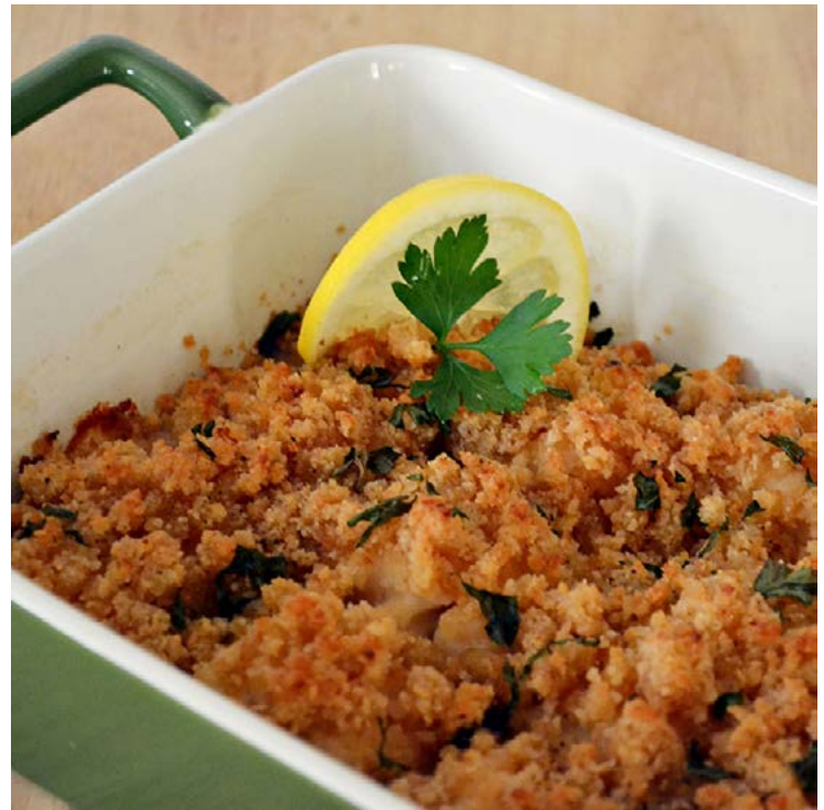
Baked Sea Scallops

5 tablespoons salted butter, plus extra for dish 2 pounds sea scallops (see Note, below) 3 large cloves garlic, minced 3 tablespoons fresh lemon juice 2-1/2 tablespoons dry vermouth 1/4 cup grated Parmesan cheese 3/4 cup panko breadcrumbs 1/2 teaspoon freshly ground black pepper 1-1/2 teaspoons kosher or sea salt