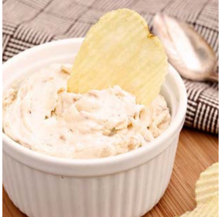
Chips and Dip

Drain the clams, reserving some of the liquid, and mash into the softened cream cheese. Add the remaining ingredients and blend well. If a thinner dip is required, use 1 or 2 tablespoons of the reserved clam liquid to thin the mixture. Serve with corn or potato chips.