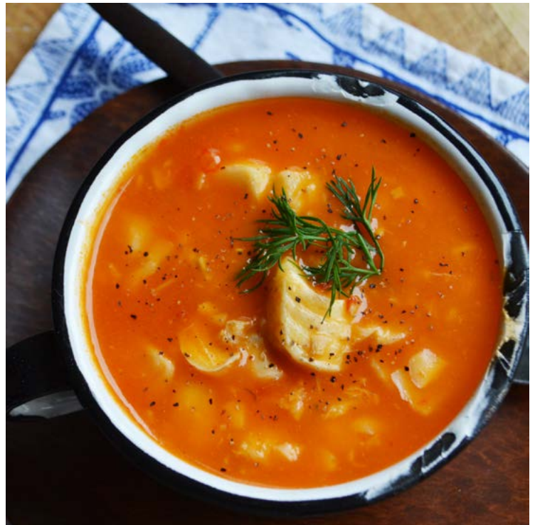
Mock Lobster Soup

Bring the water to a boil. Add the fish and dill and simmer until tender, about 15 minutes. Remove the dill sprig. Breakup the fish with a fork. Add the undiluted soup and simmer for 5 minutes longer. Dot with butter and sprinkle with pepper and parsley.