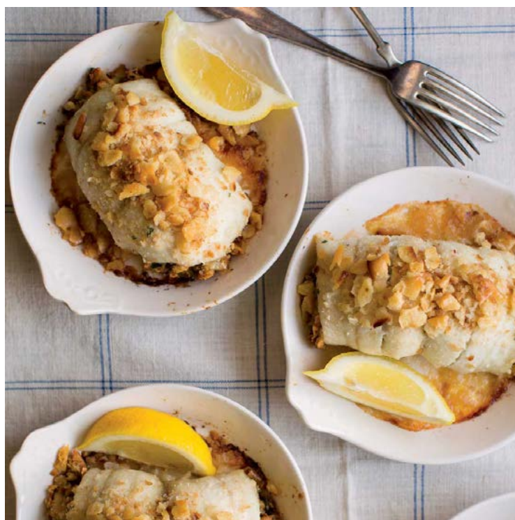
Baked Stuffed Fish

Preheat your oven to 350° and set a rack to the middle position. Lightly grease an 8-inch-square baking pan. In a medium-size bowl, combine 1 cup of the crackers with the crabmeat, mayonnaise, parsley, chives, lemon zest, lemon juice, and cayenne. Lay the fish fillets, dark side up, on a work surface. Divide the filling evenly among the fillets, spooning it in the center of the fish. Roll ends up around the filling. Place the fish, seam side down, in the prepared baking pan. Toss the remaining 1/2 cup of the crackers with the melted butter, and sprinkle over the fillets. Bake until the fish is opaque and cooked through, 20 to 25 minutes. Serve immediately with lemon wedges.