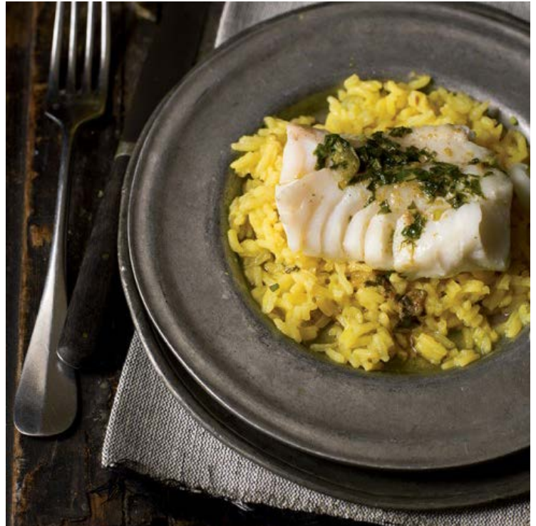
Cod with Ginger-Basil Butter on Fragrant Rice

This tasty baked dish pairs firm whitefish with a savory vegetable stuffing.