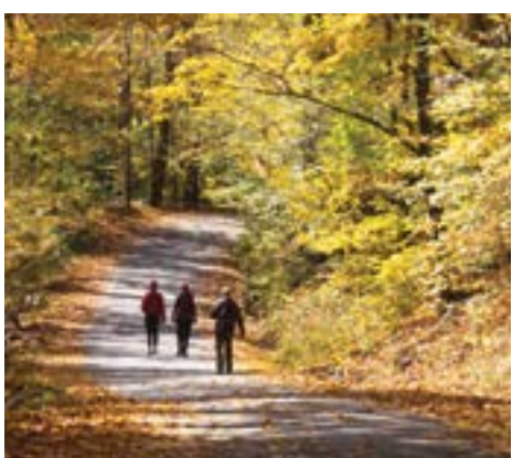
Several of New Hampshire's state parks are located on or near mountains. Some offer scenic auto roads, and all offer hiking trails.