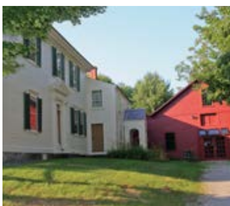
State Historic Sites preserve and extend New Hampshire's cultural and historical heritage. These 16 sites let visitors experience New Hampshire's history.