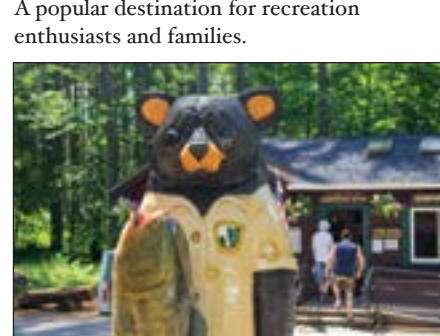
A nine-foot-tall carved wooden bear greets campers at Bear Brook State Park. Tucked away in the forest, this 101-site campground is just 25 minutes from Manchester!

48. Bear Brook State Park 61 Deerfield Rd, Allenstown 485-9869 A popular destination for recreation enthusiasts and families.