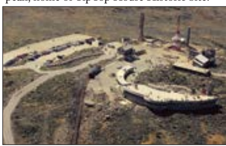
On a clear day, views from the Mt. Washington State Park Visitors' Center extend as far as 130 miles to Vermont, New York, Massachusetts, Maine, Quebec, and the Atlantic Ocean.