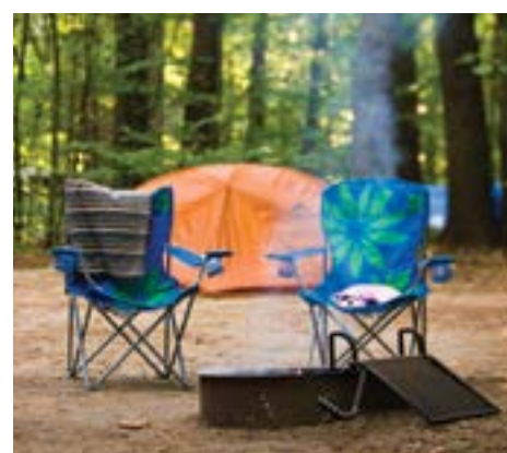
New Hampshire State Parks include 20 campgrounds offering a range of accommodations, from primitive sites to full hookups, as well as cabins and yurts.