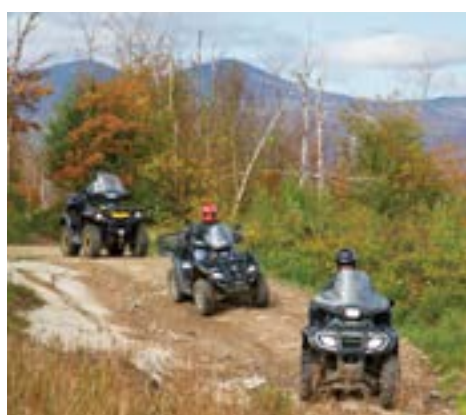
New Hampshire offers roughly 1,000 miles of ATV and OHV riding trails. We have trails for all abilities, and riding mileages vary by region.