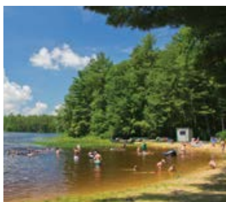
Swimming, fishing, canoeing, and other water activities, either freshwater or ocean, are major features of many of New Hampshire's state parks.