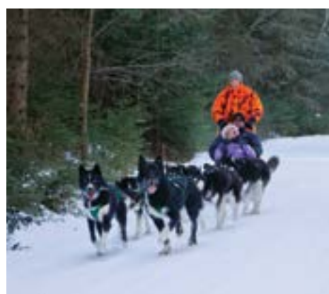
New Hampshire State Parks offer wonderful winter activities, from alpine skiing, cross-country skiing, and snowshoeing to wildlife viewing, dogsledding, camping, and more.